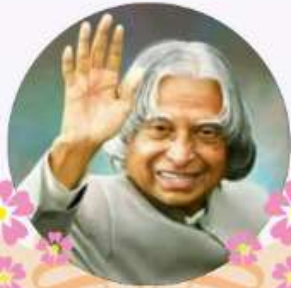
Dr.APJ Abdul Kalam Birth Anniversary 15th October 2020

"If you fail, never give up because FAIL means "First Attempt In Learning."