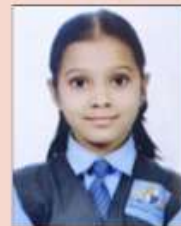
Avanti Ajmire Class-3 rd